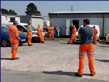
Social distancing during meetings outdoors

Objective: To reduce or eliminate transmission due to face-to-face meetings and maintain social distancing in meetings.