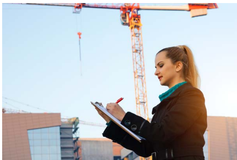
Visitor signing in

Maintaining a record of all visitors, if this is practical.